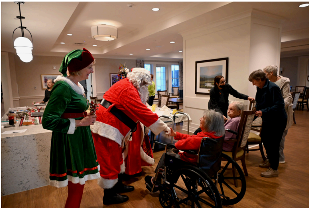
Santa and his elf greet residents and spread holiday cheer at a Sunrise Senior Living community in Virginia, Dec. 9, 2023.