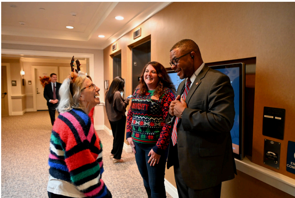
A DSS special agent on Santa's protection detail chats with a resident at the Sunrise Senior Living community in Virginia, Dec. 9, 2023.