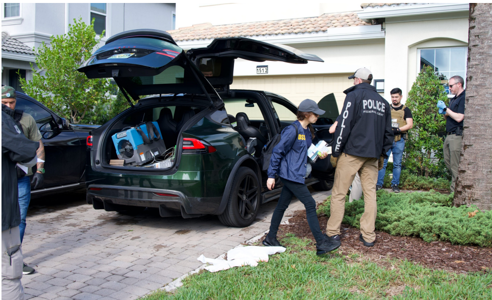
A DSS evidence custodian (center) provides evidence collection kits to DSS and HSI special agents to process Panin's home, Hollywood, Fla., June 7, 2023.