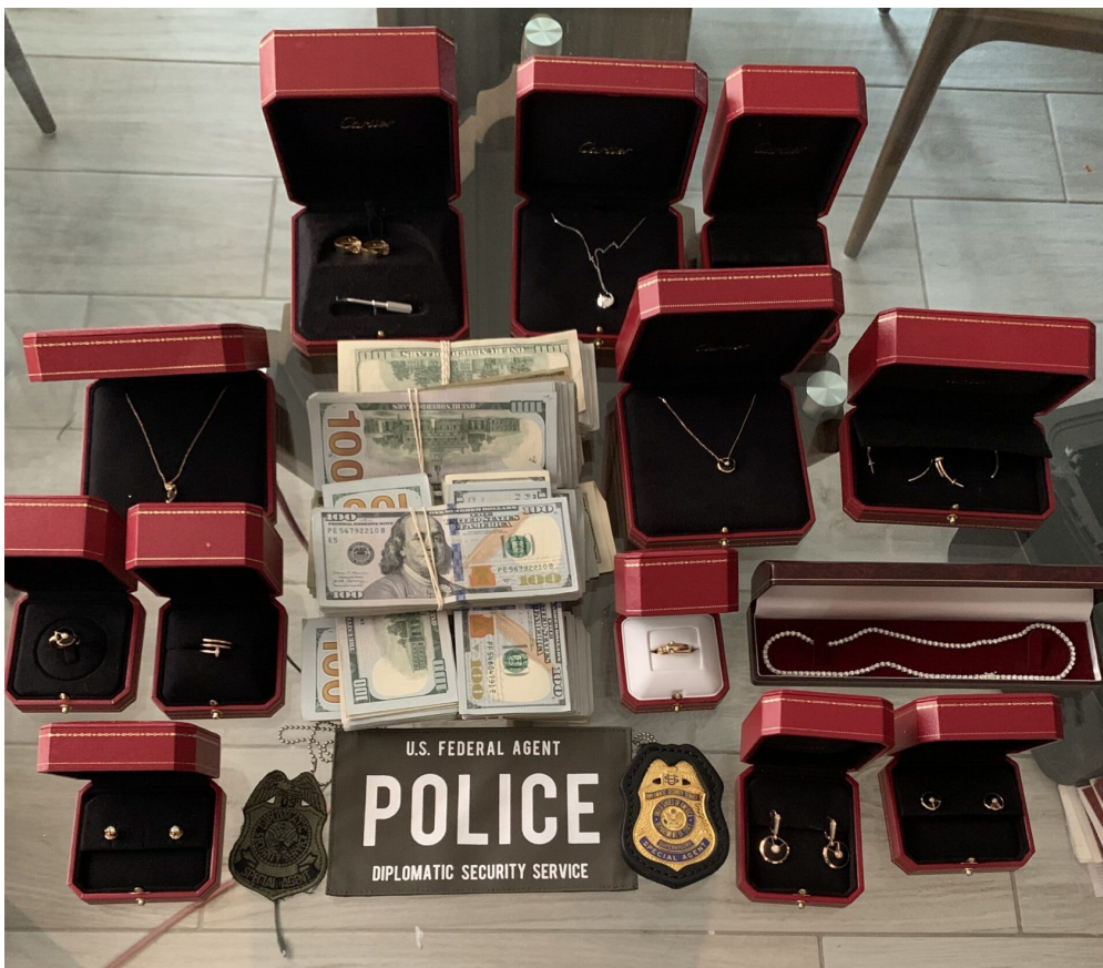
Cash, jewelry and thumb drives (suspected of containing cryptocurrency proceeds from Panin's operations) confiscated because of a DSS search warrant, Hollywood, Fla., June 7, 2023.